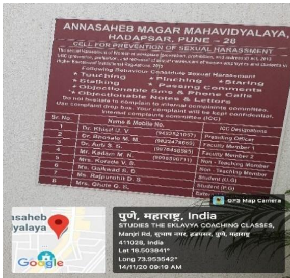
1) Cell for prevention of Sexual Harassment